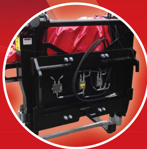
Standard bolt-on bracketing system to fit telehandlers