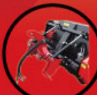
3 Point Linkage