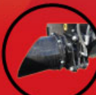
Hydraulic Stone Trap/ Shut Off Flap